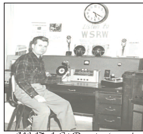
GIJADA Ed Record 1962 50th